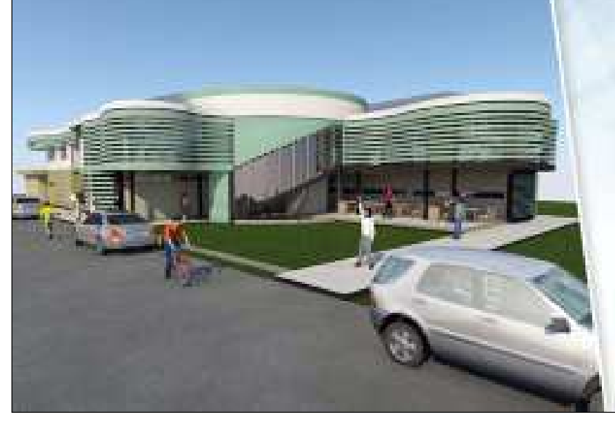
A Rendering drawing of The Jay and Sylvia Sobhraj Center for Behavioral Studies building